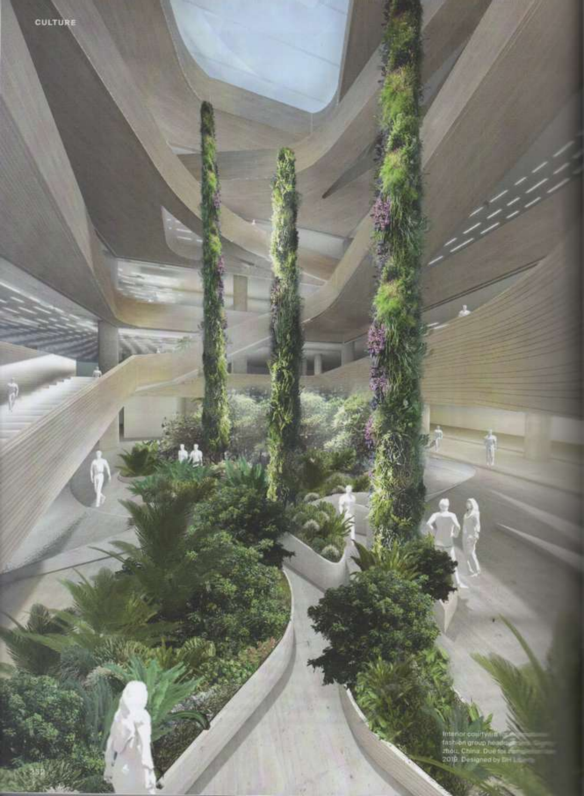
Interior courtyard of a fashion group headquarters in Zhou, China. Due to the pandemic, the project was delayed until 2019. Designed by Eric Laine