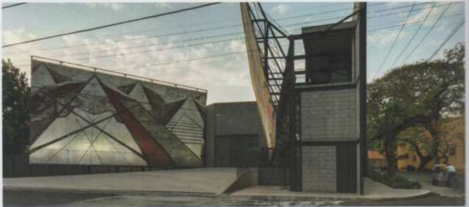
Opposite page The AllBright. Designed by No.12.

female taxi drivers or female journalists. But 'female architects' seems to be an unshakable phrase." She continued to outline her desire for a mind shift that would allow men and women to work and compete within the same parameters, "known simply as good architecture".